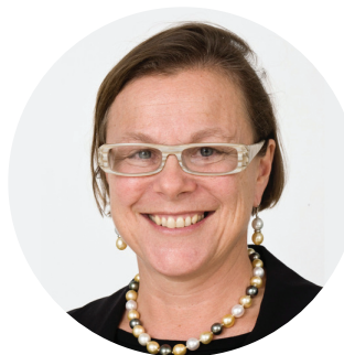
Professor Fiona Wood